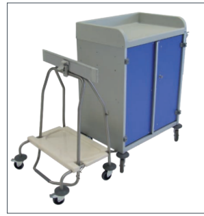
Fixed attaching device for linen distribution trolley