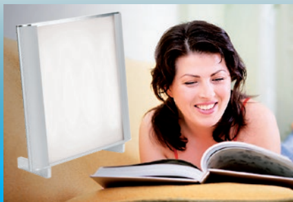
Home LED MEDIC-4