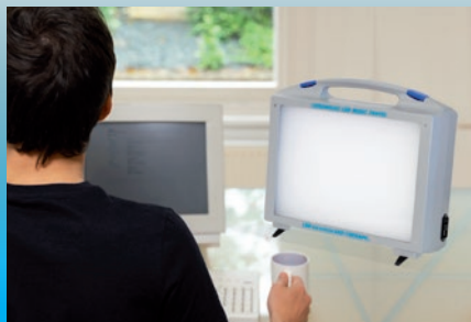
Travel LED MEDIC-Travel