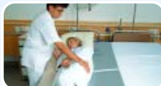
Patient Transfer Systems