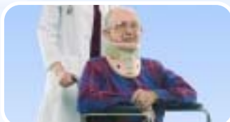
ChairCall® Sensor System

Ask for separate brochures for the other products in the Samarit range!