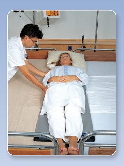
Gently push the patient at the shoulder and hip, without applying force, and transfer.