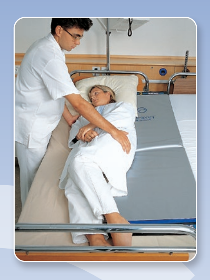
Turn the patient onto the side, slide the board under the body and return the patient to the original position.