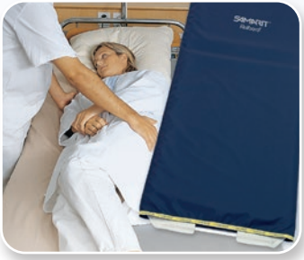
SAMARIT Rollbord H-Line