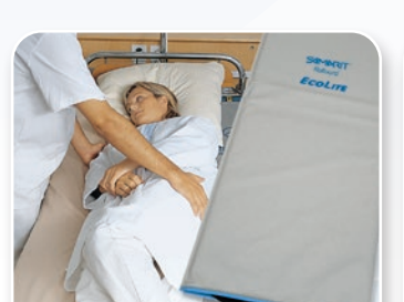
SAMARIT Rollbord ECOLite

Ask for separate brochures for the other products in the SAMARIT range!