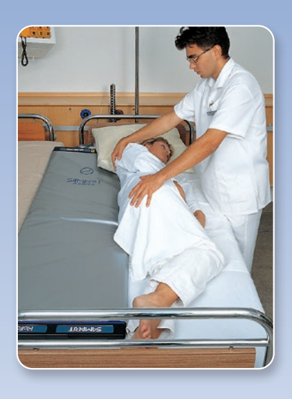
Turn the patient onto the side. Remove the Rollbord starting at the feet.