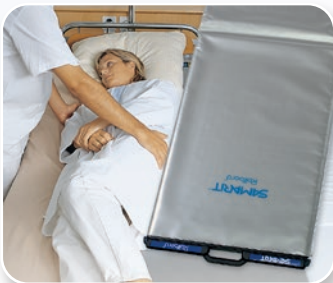
SAMARIT Rollbord Hightec