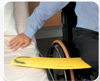
SAMARIT Nursing Aids

Download your language from our website or ask your local distributor.