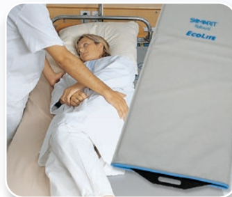
SAMARIT Rollbord ECOLite